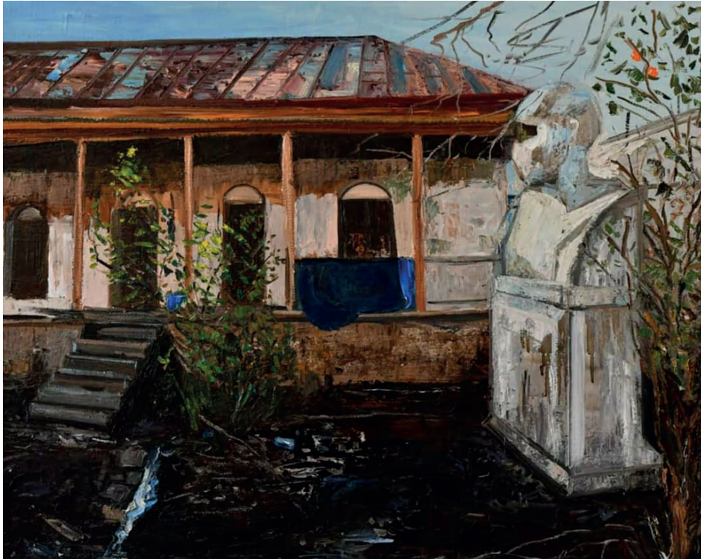
Fig 4. Nigar Helmi "Bulbul destroyed house museum. Shusha" (canvas, oil paint, 100x130 cm)