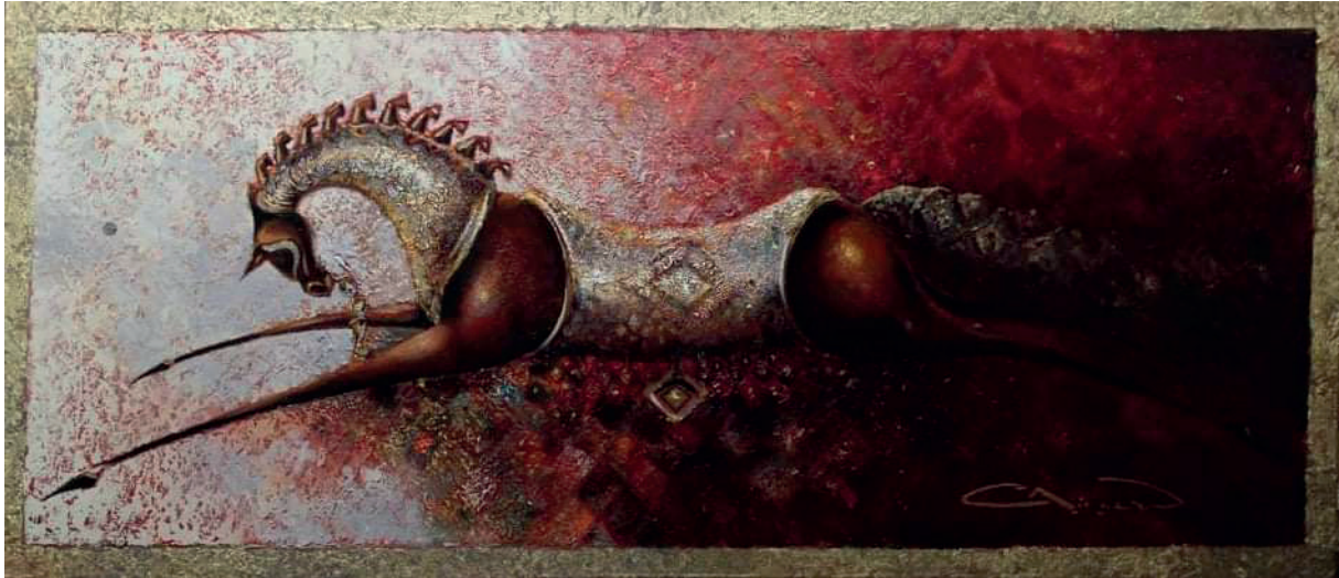
Fig 2. Jalal Agayev "Horse of Victory"

We can see feelings of patriotism and bravery in the presentation of Jalal Agayev's brush. In the work "Horse of Victory" (fig 2), the artist who presented the power of the victorious people gathered the ideas of dynamics and struggle on the image. Reminiscent of a carpet composition, the rhythmic repetition of ornaments is illusory.