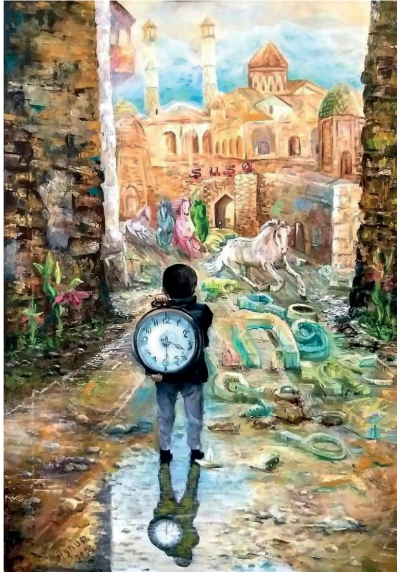
Fig 3. Aynur Novruzova "Return" (2022) (canvas, oil paint, 70x100 cm)

After Armenia invaded Karabakh, it destroyed the architectural monuments and mosques of Azerbaijan. Armenia, which prefers the policy of vandalism, kept pigs in mosques without paying attention to religious values. Nigar Helmi presented the Armenian brutality in the works "Destroyed Aghdam Mosque" (fig 5), "Bulbul's destroyed house museum. Shusha".(fig 4)