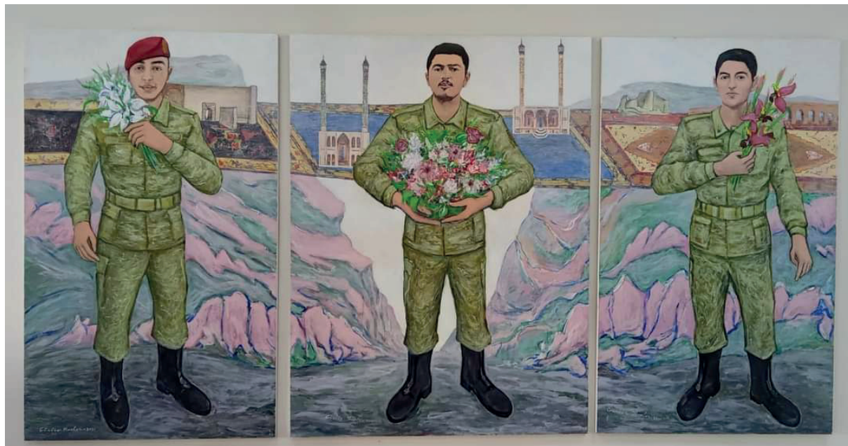
Fig 6. Gunduz Hunlar "Sing a song, let all Azerbaijan sing" (2021) (acrylic, 400x203 cm)

In the triptych "Sing a song, let all Azerbaijan sing"(fig 6) dedicated to the young people who were martyred for Karabakh, Gunduz Hunlar depicted the images of our soldiers singing rhapsody to our free lands and waking up kharibulbul with their footsteps. The architectural monuments in the background, the monumental images of our heroes who were martyred for the sake of the motherland standing in the front always sound like a song in the hearts.