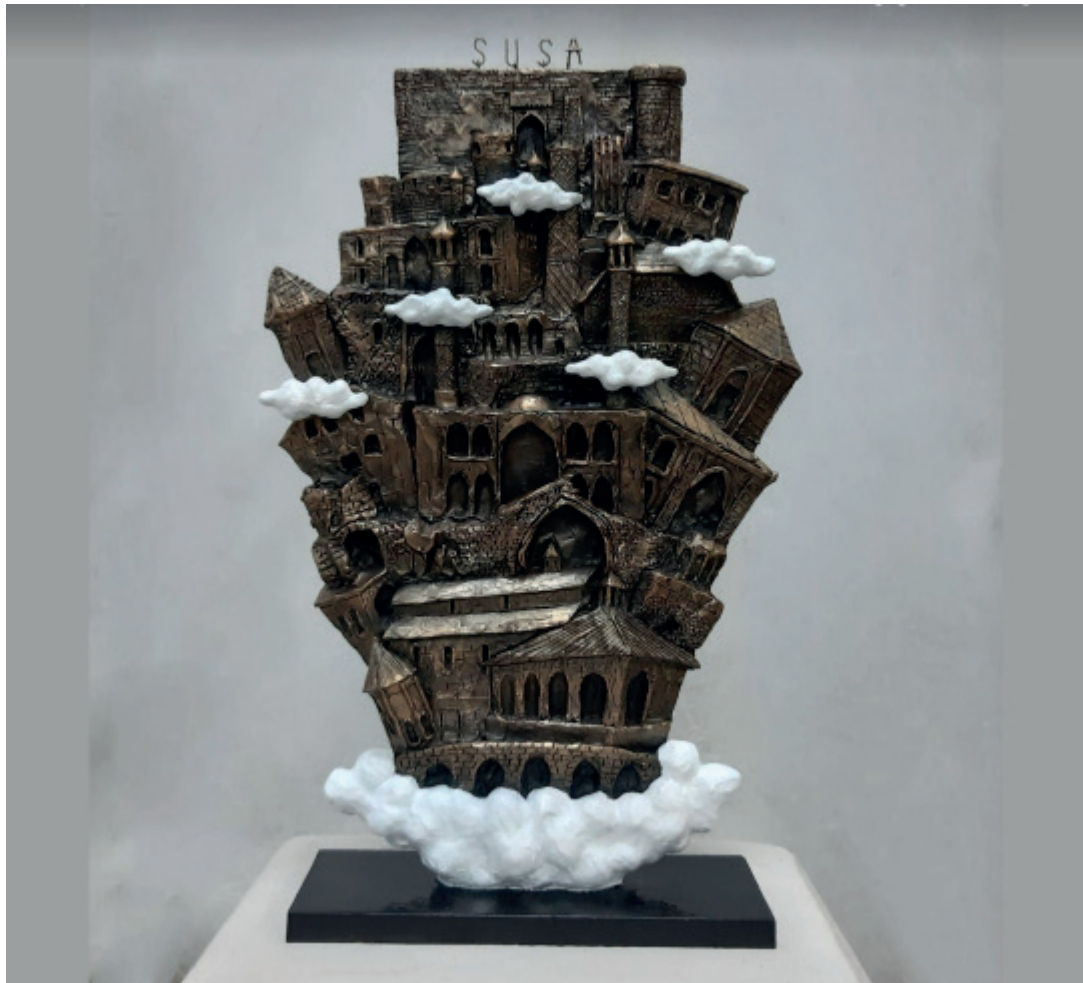
Fig 1. Rahib Garayev "Karabakh" (bronze, marble, 58x38x12 cm)

The subject of Victory is always relevant in Azerbaijani sculpture. By placing the architectural monuments of the historical land in the "Karabakh" (fig 1) composition authored by Rahib Garayev, our cultural capital completes Shusha as a peak. The artist preferred the texture of bronze and marble materials.