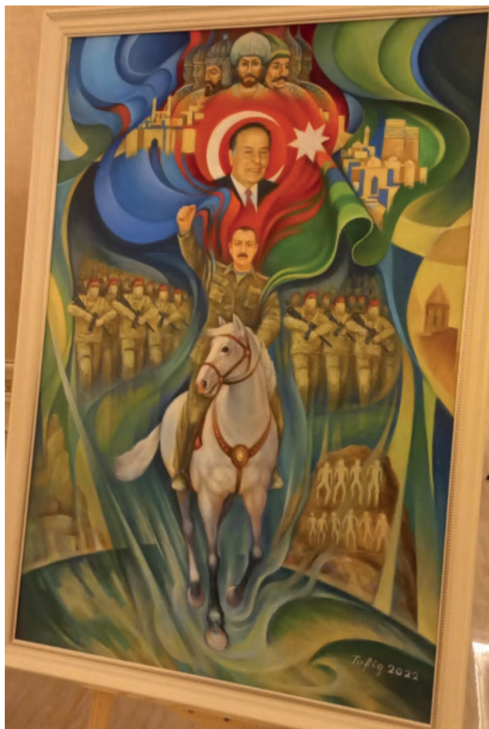
Fig 6. Tofiq Ahmadov "Victory" (canvas,oil paint)

The victory of the Azerbaijani people in Karabakh has turned into an iconographic image and plot line in the creativity of our artists and led to the creation of a series of works.