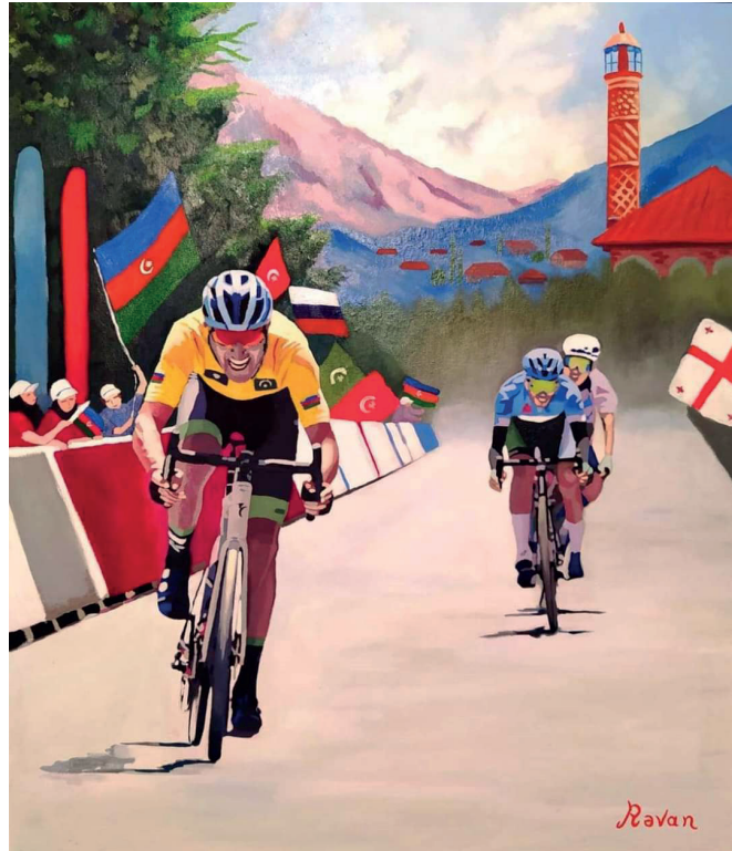
Fig 4. Ravan Sadigov “We came to dear Shusha” (2022) (canvas, oil paint, 60x80 cm)

The work “We have come to dear Shusha” (fig 4) is dedicated to sports on canvas, in oil painting technique. After the liberation of Karabakh from occupation, it has become a place where sports competitions are held. Artist Ravan Sadigov presents cycling competitions in front of the history, architecture and colorful mountains of the cultural capital of Shusha. People’s joy is mixed with each other.