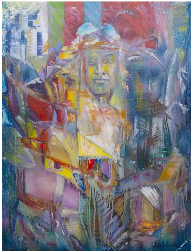
Fig 3. Adalat Kara "Single mother" (canvas, oil painting, 125x97 cm)

In Nigar Helmi's work "Hopelessness" (fig 4), a mother is waiting for news from her child. Considering the horrors of the war, the mother does not let the news of her child's loss close to her. The cold color gamma makes the monumentality of the image even more impressive.