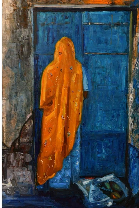
Fig 4. Nigar Helmi "Hopelessness" (canvas, oil paint, 120x110 cm)

https://www.icssiectcongress.com/icssiect-art-design-congress