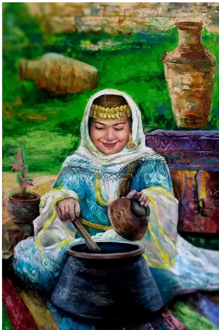
Fig 1. Aynur Novruzova "Shusha" (canvas, oil paint, 70x90 cm)

Aynur Novruzova draws attention to the beauties of our historical land in the work "Shusha" (fig 1) dedicated to the cultural capital of Azerbaijan. The artist who prefers decorative-applied art samples preferred clothing, jewelry, coppersmithing, ceramics, ornaments. The symbolic image of the work is undoubtedly the kharibulbul. Preparing to welcome guests to the capital of culture, .Shushali women stands out for her cheerfulness.