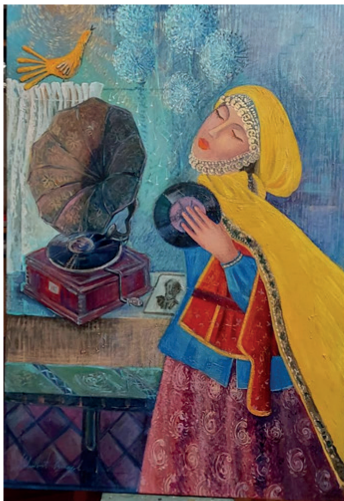
Fig 6. Malahat Ismayil "Bulbul sings" (canvas, oil painting, 130x90 cm)

In Malahat Ismayil's work "Bulbul Sings", it is the voice of the well-known artist from Shusha, the sound of native voices again in the free land. The young lady who listens admiringly to the nightingale's efforts attracts attention with her national dress and dynamic image.