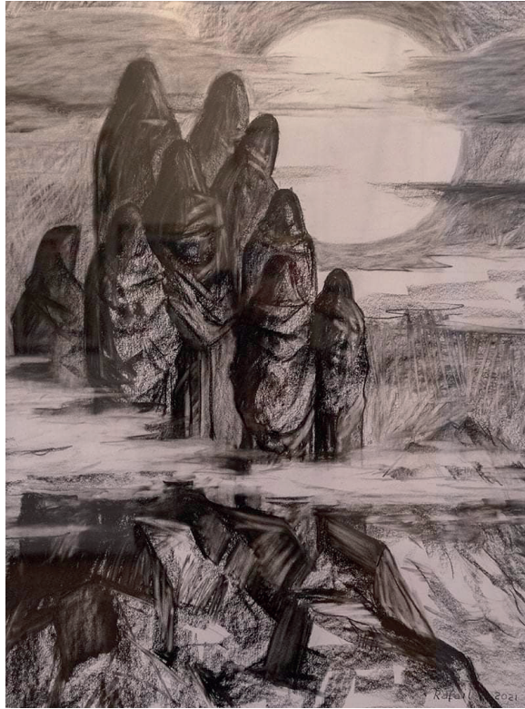
Fig 4. Rafael Alizade “Mother Mountain” (paper, 67x50 cm)

In the work “Mother’s Mountain”, Rafael Alizadeh presented mothers who sacrificed their children for the sake of the motherland, but were as strong as a mountain. Feelings of grief, sadness and pride are mixed together. The sun rising over the mother mountain illuminates their majesty.