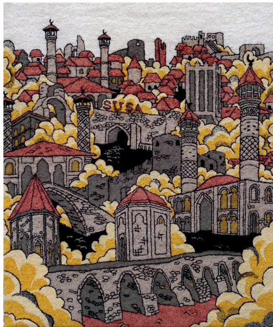
Fig 5. Rahman Kamiloglu “Karabakh” (pile embroidery, 68x58 cm)

As an example of decorative and applied art, Rahman Kamiloglu turned the architectural monuments of our historical land into colorful embroideries in his work “Karabakh”.