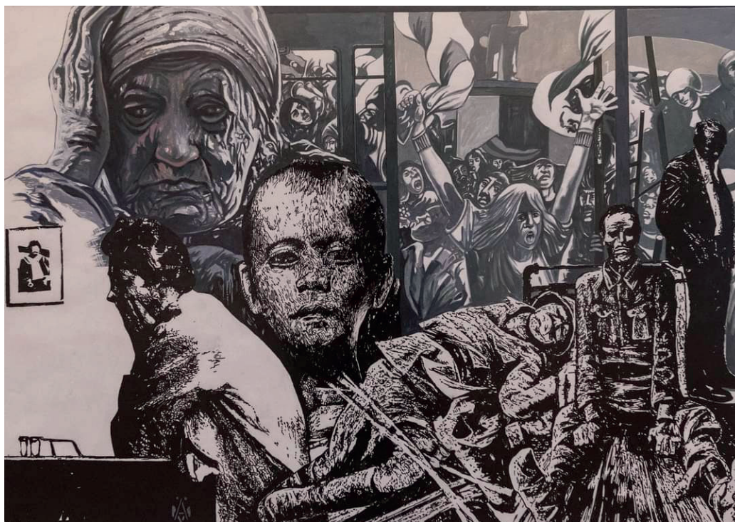
Fig 3. Mais Aliyev "After Global Warming" (paper, 82x64 cm)

In his work "After Global Warming", Mais Aliyev presents the 21st century full of disasters caused by wars, destruction of people, and freedom struggles. The main focus of the work is women, mothers, and children suffering from the war.