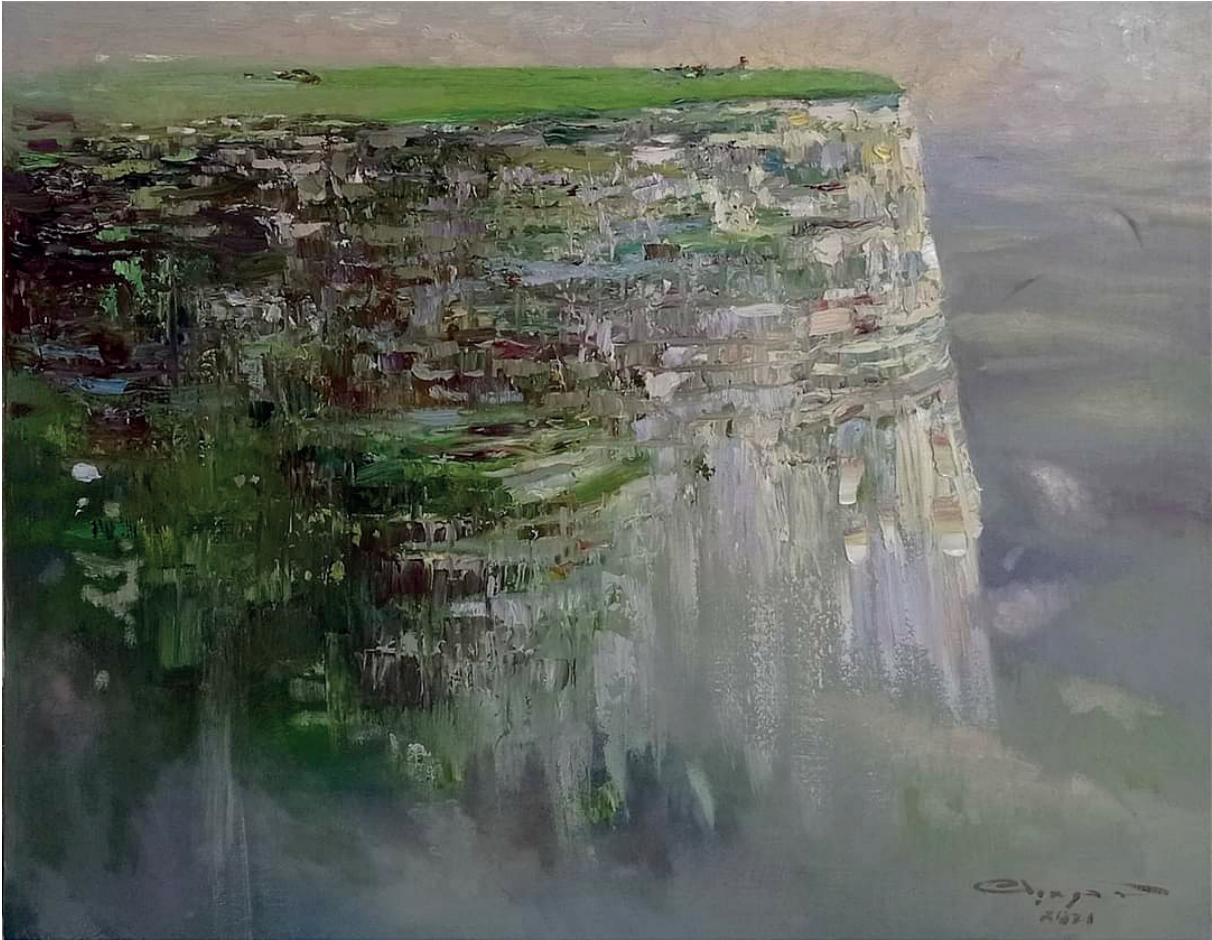
Fig 3. Jalal Agayev "Jidir plain" (2021) (canvas, oil paint)

Nigar Narimanbeyova "Shusha's beauty" (fig 4) he preferred a fairy-tale color scheme, sticking to his individual manner. The life-filled gaze of Shusha's beauty looking at the viewer, the kharibulbul held in her hand by the influence of love is the voice of freedom of the motherland. National ornaments were subject to the illusion of colors.