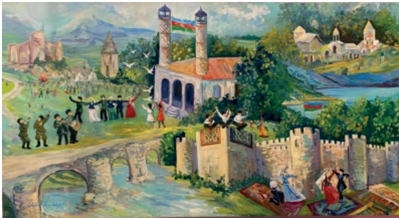
Fig 6. Malahat Ismail "Victory in Karabakh" (canvas, oil painting, 130x90 cm)