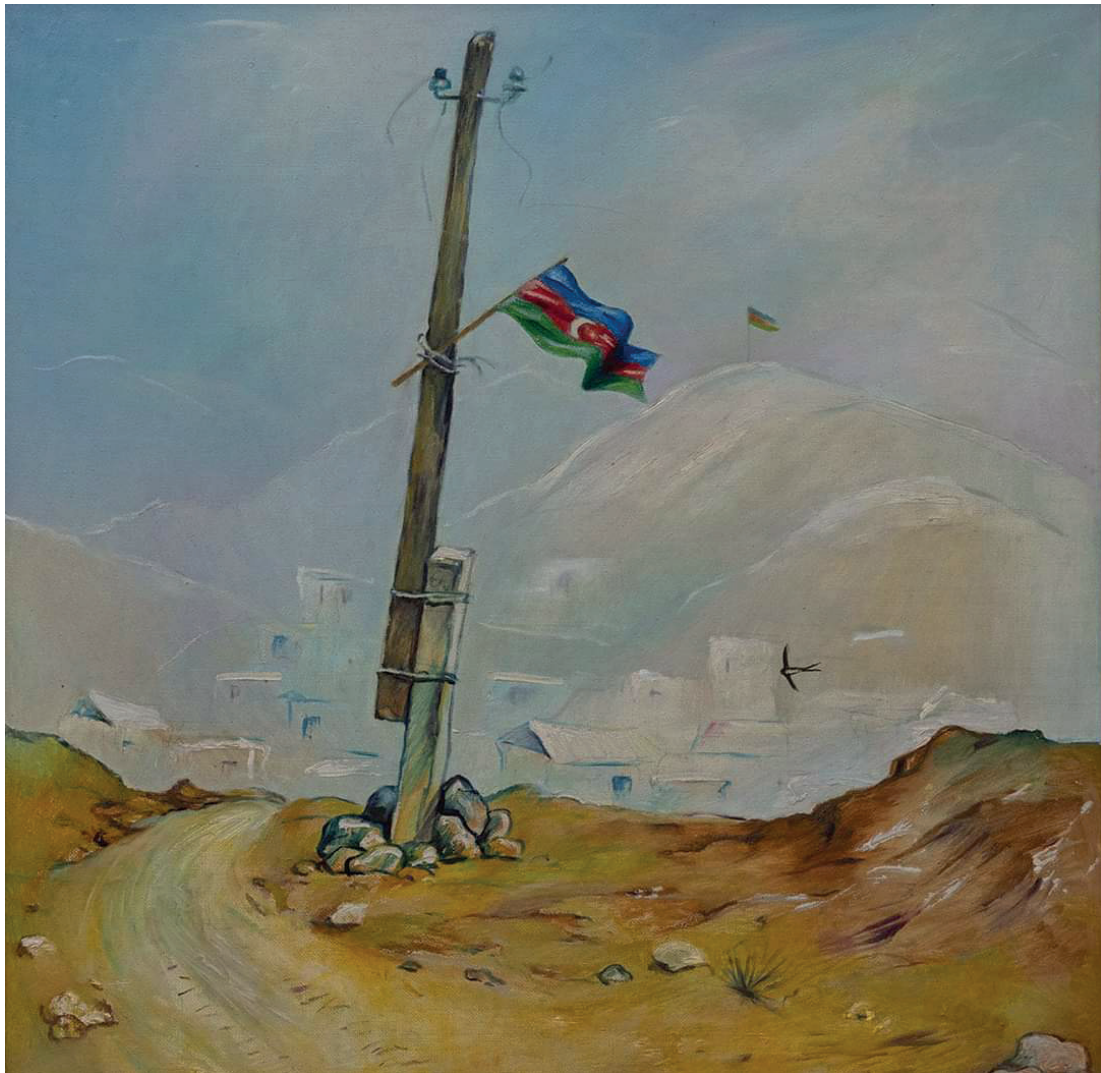
Fig 1. Ismayil Ismayilov "That day must come" (canvas, oil paint, 80x90 cm)

In "That Day Must Come" (fig 1), Ismayil Ismayilov emphasizes the path of freedom and victory through light and shadow. The raising of the tricolor flag of Azerbaijan, the flight of the swallow, is the re-liberation of the homeland.