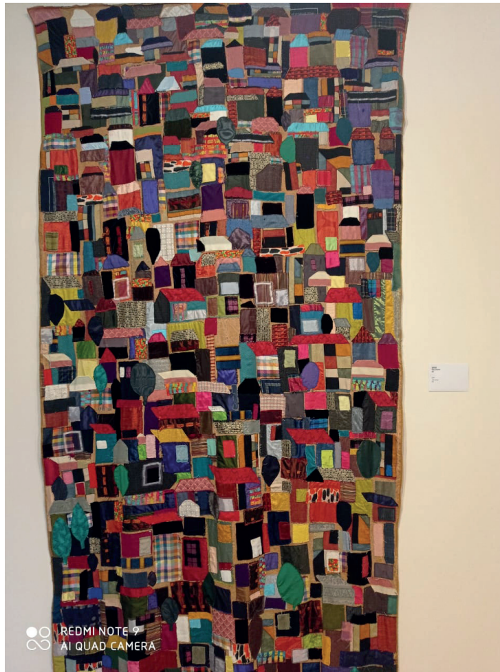
Fig 4. N. Kipshidze "City" (2005) (cloth, application)

In the works of the artist, man and nature are opposed, they are inseparable from each other. In the "Hope" composition, people's confidence is expressed with ideas based on rhythmic color solutions.