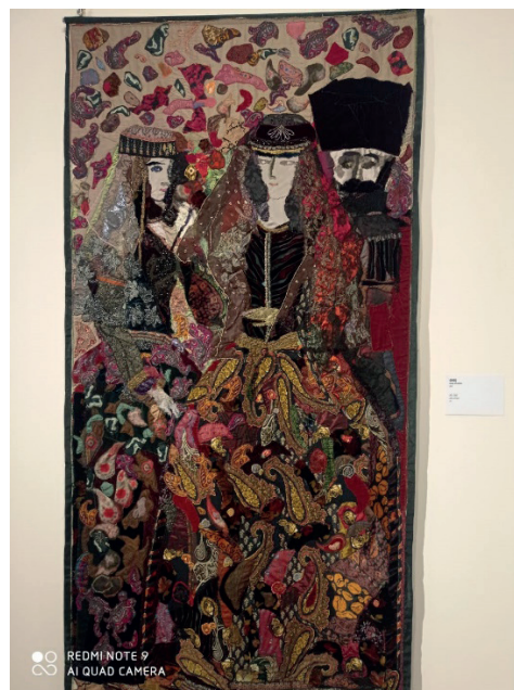
Fig 3. N. Kipshidze "Meeting" (2019) (cloth, application)

In his work, the artist has built fabric applications based on lyrical feelings. In his "Meeting" composition, the loving world of young people coming to meet in Georgian clothes was described. The synthesis of eastern and western multicultural values is revived in ornaments and decorative clothing.