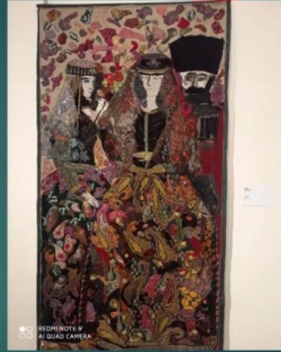
Fig 3. N. Kipshidze "Meeting" (2019) (cloth, application)