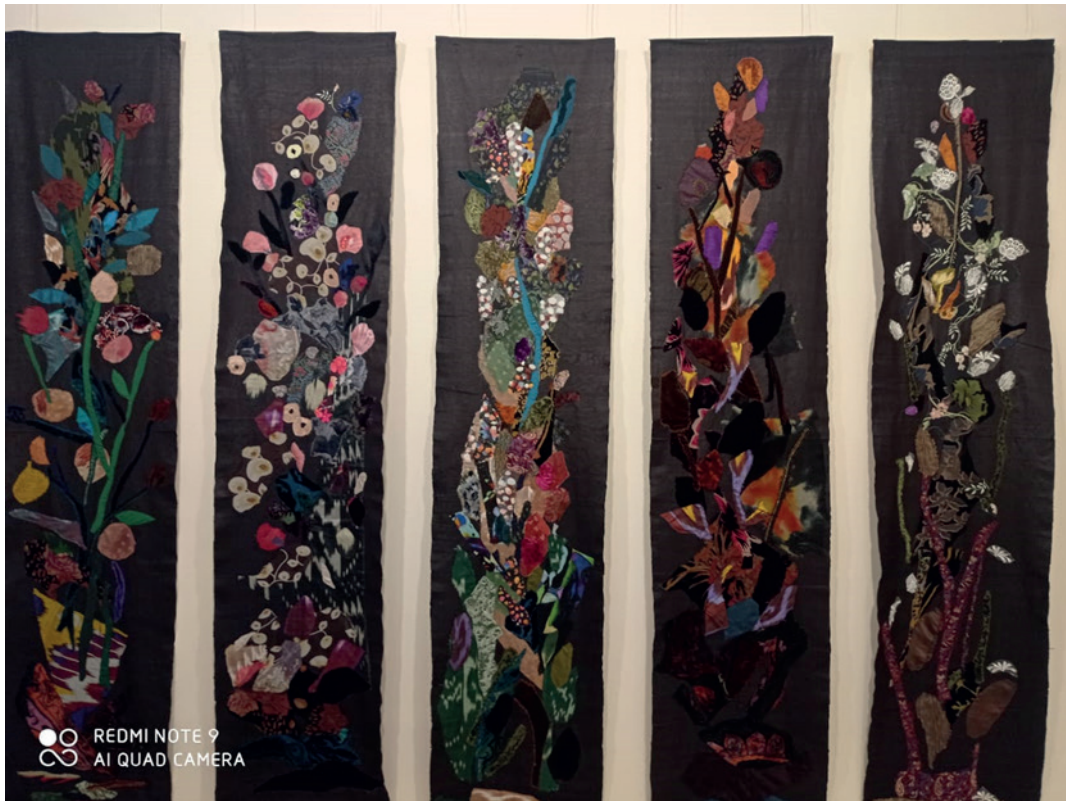
Fig 1. N. Kipshidze "Flowers" (2020) (cloth, application)

In the artist's work, we observe the mysterious colors of nature, shining images with appliqué technique. We see the presentation of works of various styles in the aura of creativity based on Eastern and Western traditions. In each of the works "Summer", "Flowers", "Spring", "White Space", the texture and structure of colored pieces are placed as additions to each other. Selected fabric effects not only serve to reveal the idea content in the composition, but also create a magical illusion. In the work "Girl with flowers" we again feel the colorfulness of the cloth. Nino Kipshidze made extensive use of buta patterns.