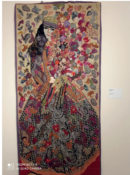
Fig 2. N. Kipshidze "Girl with flowers" (2019) (cloth, application)

In his work, the artist has built fabric applications based on lyrical feelings. In his "Meeting" composition, the loving world of young people coming to meet in Georgian clothes was described. The synthesis of eastern and western multicultural values is revived in ornaments and decorative clothing.