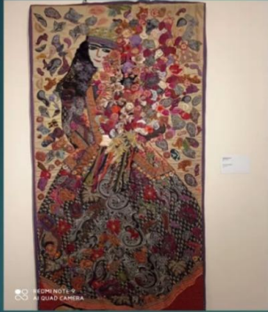
Fig 2. N. Kipshidze "Girl with flowers" (2019) (cloth, application)