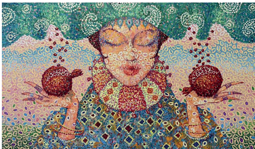
Fig 1. Mir Azer Abdullayev "The mountains of Shushan are misty" (2022) (canvas, oil paint, 130x75 cm)

Mir Azer Abdullayev surrounded dreams that came true with pomegranate seeds in his work "Shushan mountains with foggy heads" (fig 1). Shusha, our cultural capital, was presented as an image of an elegant woman distinguished by her beauty and bright clothes. The Shusha mountains, whose head is surrounded by the Victory fog, are adapted to the green color of the buta ornament and the holy religion of Islam.