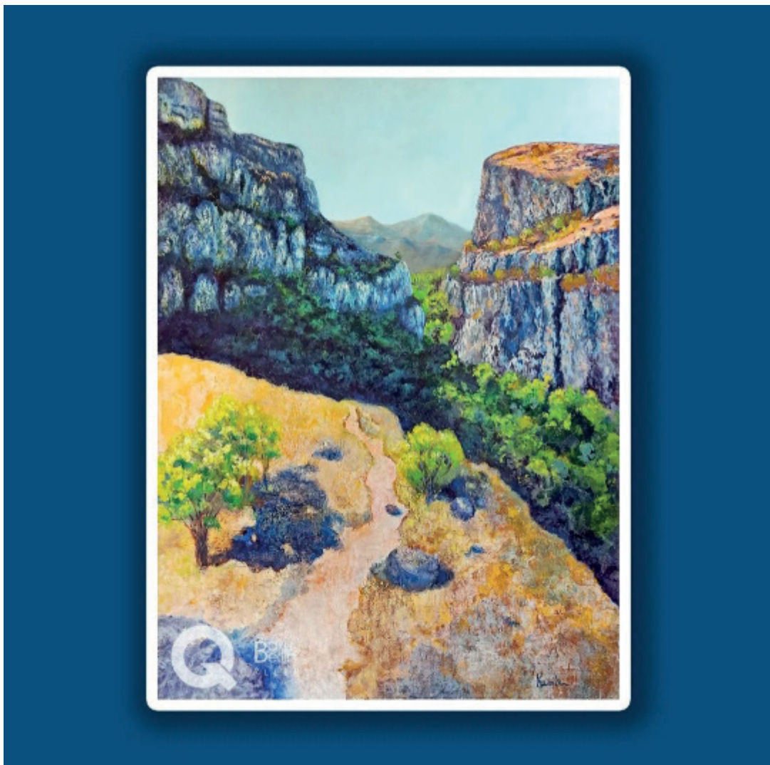
Fig 5. Kamila Muradova “Mountains around Shusha” (2021) (canvas, oil paint, 200x150 cm)

Kamila Muradova, in her work “Mountains around Shusha” (fig 5), especially emphasized the “Jidir plain”, the decoration of the historical city surrounded by steep rocks.