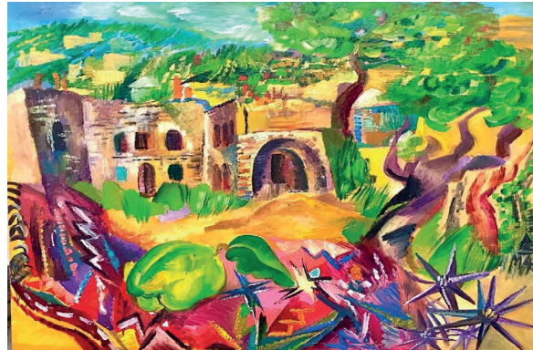
Fig 4. Asmar Narimanbeyova “Shusha” (2022) (canvas, oil paint)

It was destroyed after the occupation of Shusha by the Armenian army in the 90s. Armenia wanted to erase the traces of Azerbaijanis from the historical city. Asmar Narimanbeyova presented to the audience the revival of the beauty of Karabakh and the revival of nature in the work “Shusha” (fig 4).