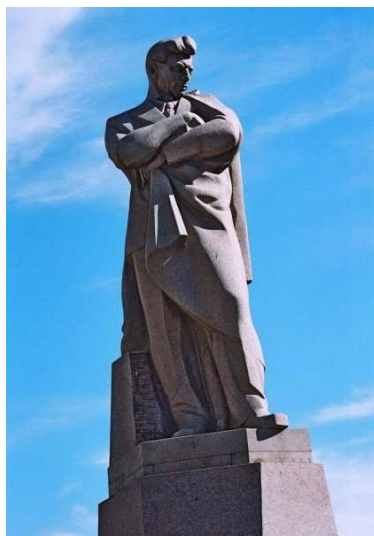
Fig 5. M. Mirgasimov "Jafar Jabbarli"

In the 7th class fine art textbook, the individual characteristics, styles and techniques of the work of the Azerbaijani national artist Mirali Mirgasimov are presented to the students on the topic "Human image in sculpture".