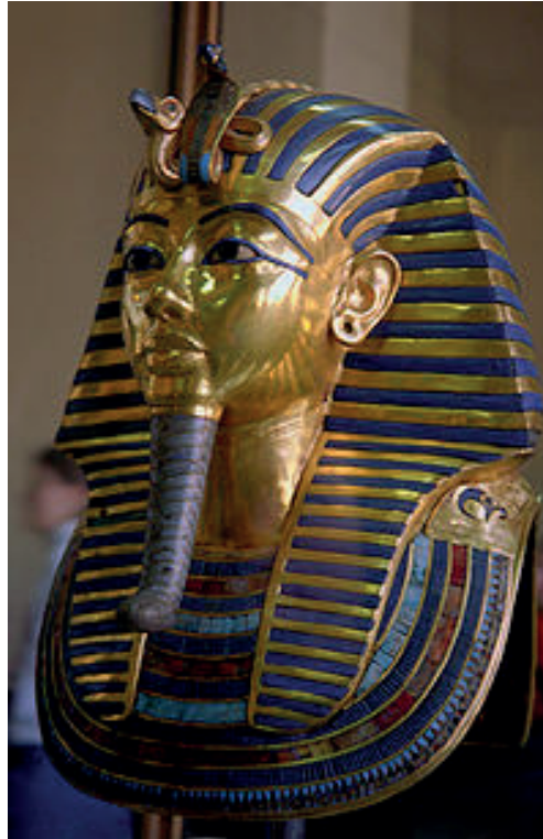
FIG 1. Burial mask of Tutankhamun

This textbook examines the symbols and colors of ancient Chinese clothing. In the 5th class fine arts textbook, on the topic “Western European 17th decorative-applied art”, we observe the splendor and richness of the clothes of the French king Louis the 14th, the form, pattern and clothing elements in the costumes of that century. In the illustration, a trip to the history of clothing of the 17th century is made from the parts of the aristocratic clothing, such as justokor, bafta, cuffs, and collar.