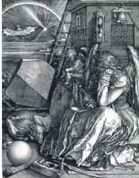
FIG 2. Albrecht Dürer "Melancholia"

Information about the work of the genius sculptor, architect, painter and poet Michelangelo Buonarotti is brought to the attention of students in the sixth grade fine arts textbook. The sculptor's masterpiece composition called "Pyeta" is presented in the textbook.