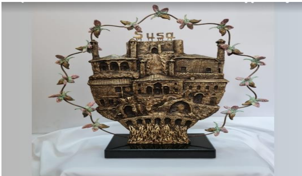
Fig 4. Rahib Garayev “Karabakh” (2021) (bronze, 52x50x12 cm)

Nazrin Khalafova “Shusha. Yukhari Govhar Aga Mosque ”(fig 5) based our historical architectural monument on the descriptive language of the fairy-tale color scheme. In the composition "Bayati-Shiraz" (fig 6), a young lady playing the national instrument of Azerbaijan on the kamancha dedicates her performance to our liberated Shusha. Bayati-Shiraz's love of country was mixed with the song of colors.