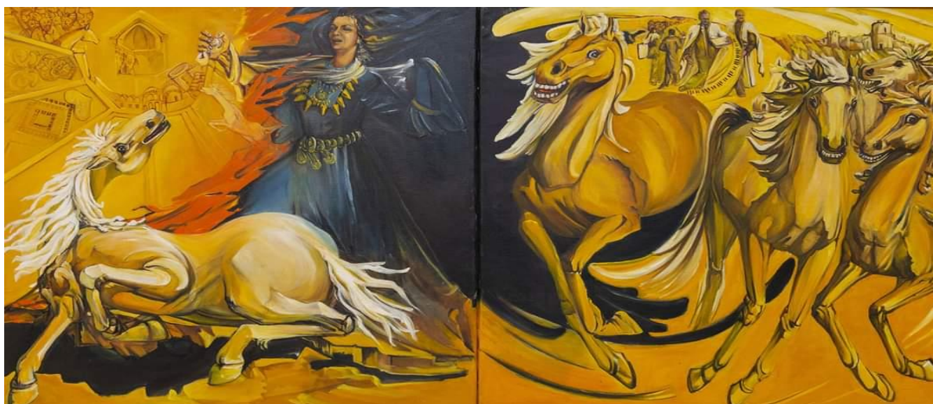
Fig 2. Tamilla Seyidova from the series "Karabakh Shikasta" (2021) (diptych canvas, oil paint, 200x100 cm)

Orkhan Garayev is faithful to the traditions of surrealism in his composition "The End of Longing" (fig 3). The main idea is patriotism. The liberated land is embraced by human hands. In the upper part of the composition, the artist drew attention to the heroic path of our army, which liberated our lands from occupation and put an end to longing.