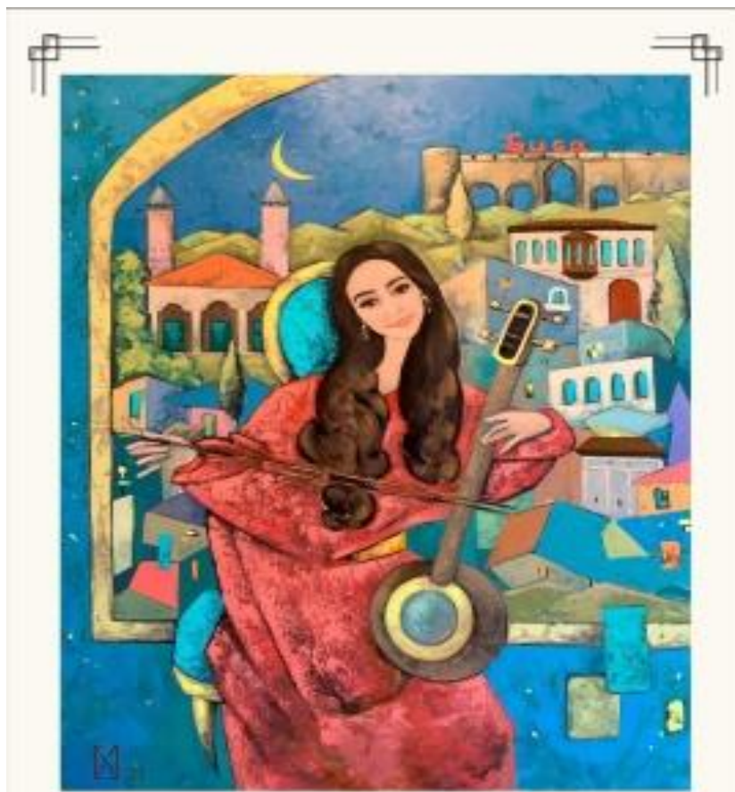
Fig 6. Nazrin Khalafova “Bayati-Shiraz” (2021) (canvas, oil paint, 130x100 cm)