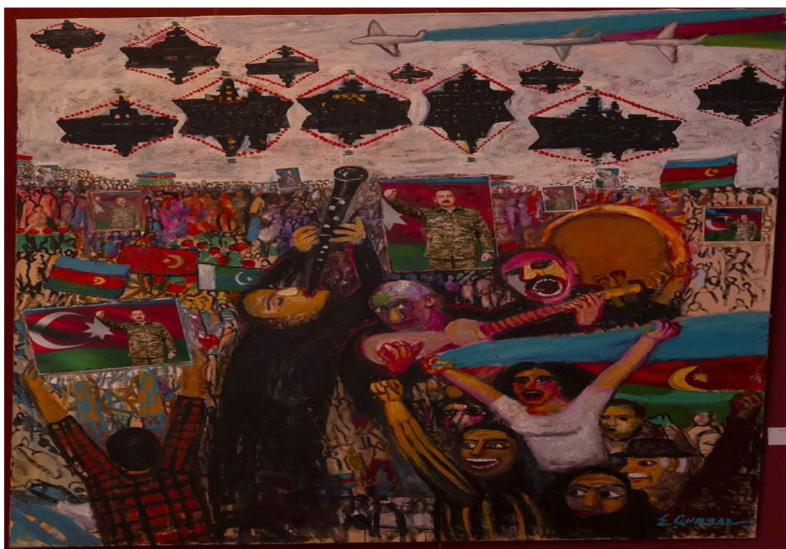
Fig 1. Eldar Gurbanov “Victory” (2021) (canvas, oil paint, 170x145 cm)

The theme of victory, which occupies an important place in the fine arts of modern Azerbaijan, is also important in expressing the patriotic feelings of our talented artists. Eldar Gurbanov presented the joy of the people who have been waiting for the news of the liberation of Karabakh for years in the painting "Victory" (fig 1). The image of the images in an unusual form, the contrast of the color palette, is a celebration of the historic victory.