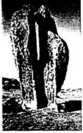
STONE-ARBA (bar 333-360)

Daşda döyüş, - qayada qovğa! - Heyrətlə açılmış - ağızda mağara! - Çıldındı, - dağardı, - gör "nəğardı" - bu daş nağara! - "Tap! - Tap! - Ovu tap! - Topala! Tap! - Tap ha! - Topala! - ikibir-üçbir, - topa-topa - topala! - Topala, topala..." - Qaç-qaç gəlmişik! - Yüyürmüşük yelli-yelli. - Sən o yolla, - mən bu yolla. Siz o yallı, - biz bu yallı. - Di, ya allah! - Haydi, igidlərim, - Hoydu, dəlillərim, - Halay vurun, - Yallı gedəlim! - - - Yallı!