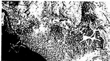
CHASING THE DEER (bar 142-188)