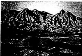
706 THE LANDSCAPE (bar 1-75)

are ment to be a guide for the Choreographer