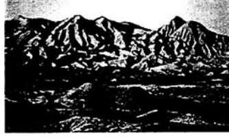
GOBUSTAN (bar 693-770)