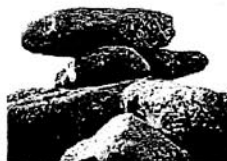
THE GAVAL DASH (stone tambourine) (bar 76-114)