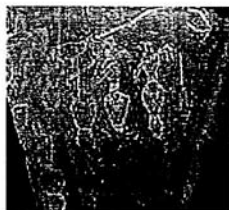
MUGHAM: THE SEVEN BEAUTIES (bar 189-255)