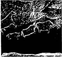
THE BUFFALO HUNT (bar 417-475)