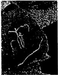
THE HARVEST (bar 516-533)