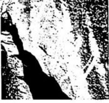
YALLI: Round Dance (bar 660-692)

Qvni-la-qvni-la - qovruidu şimşək. - Qovrula-qovrula - qov oldu şimşək! - Qov ola-qov ola - ovuldu şimşək. - Ovula-ovula - qovuldu şimşək! - - Qayada izi qaldı, qaya - dan yerli - Daşlarda izi qaldı, - daşlar - dan yerli! - Qayadan yeri, daşdan yeri... - Qara daşlar - qürub, - Qızıl qayalar - qurur! - Bir səs gəldi kahadan, - koksünü ötürdü kaha: - Burda hər axşam - günəş tonqal qalayır, - Qobustan qaladır - Qürur qalası!