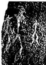
DANCE OF THE WARRIORS (bar 256-283)