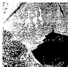
DANCE OF THE 3 MAIDENS (bar 284-312)