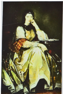
'Khurshud Banu Natavan', Oqtay Sadiqzade. 1983. Rustam Mustafayev Azerbaijan State Art Museum