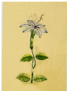
'Flower', Khurshud Banu Natavan, 1880. Jafar Jabbarli State Theatre Museum

The prominent Azerbaijani poetess Natavan, known as the khan's daughter and deeply respected for her good deeds, was the daughter of the last Qarabagh ruler Mehdiqulu khan and the granddaughter of Ibrahimkhalil khan. From childhood she was interested in music, art and classical Eastern poetry and she learnt a number of languages. Natavan was also an artist with delicate taste and she produced wonderfully artistic embroidery. The few of her artworks that have survived have enriched Azerbaijani art with their hues. History records that she presented her embroidery to the entranced French writer Alexandre Dumas, who was on a trip to Baku. The poetess's paintings are also of artistic interest. The beauty of Khurshudbanu Natavan's artistry may be seen in the 227-page album that she created in 1886 (now held in the Muhammad Fuzuli Institute of Manuscripts). Paintings of different flowers – roses, violets, carnations, jasmines, poppies and irises – in watercolour and pencil are collected here. In the images of nightingale and moths the artist's knowledge of the artistic traditions of realist art can be sensed. Her desire to follow in the traditions of 19th century Azerbaijani art, reflecting a combination of traditional and realist art, are seen in her images of birds, horses, houses, mountain roads, bridges and others. The album also contains Shusha landscapes and images of Shamil palace.