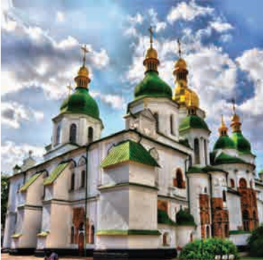
Saint-Sophia Cathedral, Kiev, Ukraine, 1990