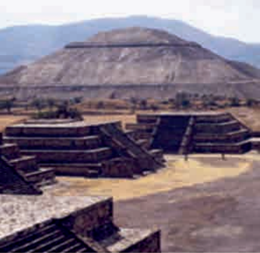
Pre-Hispanic City of Teotihuacan, Mexico, 1987