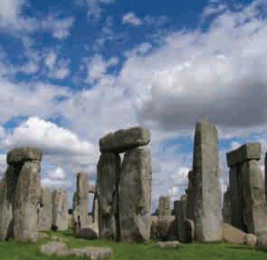
Stonehenge, Avebury and Associated Sites, England, 1986