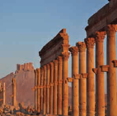
Site of Palmyra, Syrian Arab Republic, 1980