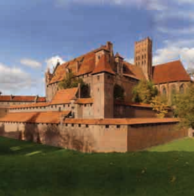
Castle of the Teutonic Order in Malbork, Poland, 1997