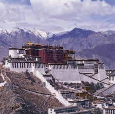
Historic Ensemble of the Potala Palace, Lhasa, China, 1994