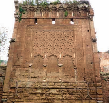
Rabat, Modern Capital and Historic City: a Shared Heritage, Morocco, 2012