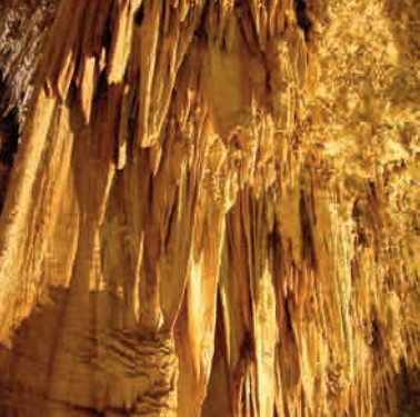
Carlsbad Caverns National Park, United States of America, 1995