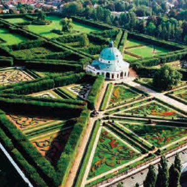
Gardens and Castle at Kromerits, Czech Republic, 1998