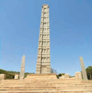
Aksum, Ethiopia, 1980