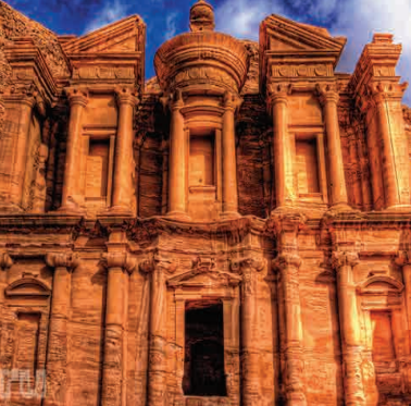
Petra – Ancient City, Jordan, 1985