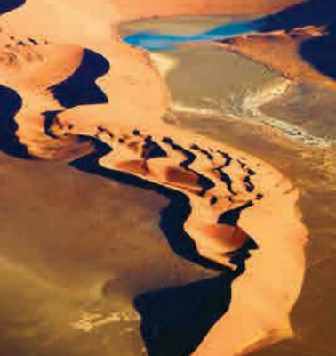
Namib Sand Sea, Namibia, 2013