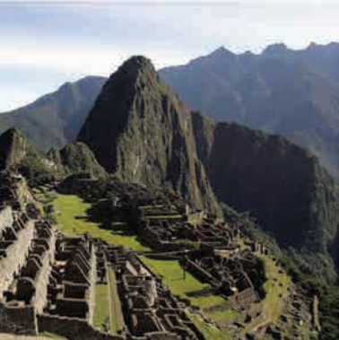
Historic Sanctuary of Machu Picchu, Peru, 1983