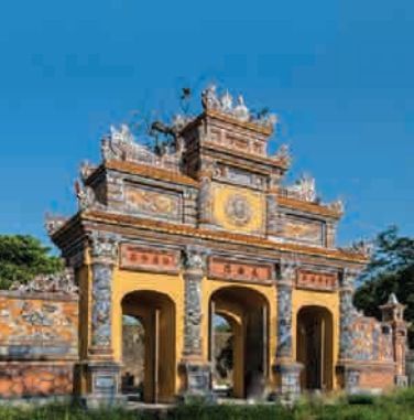
Complex of Hué Monuments, Viet Nam, 1993