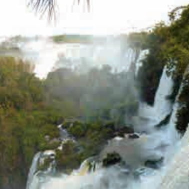
Iguazu National Park, Argentina, 1984