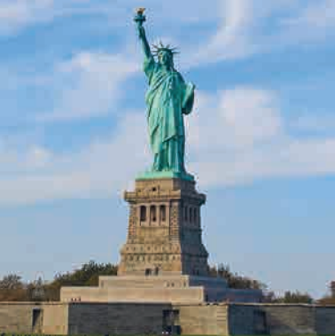
Statue of Liberty, United States of America, 1984