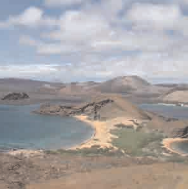
Galápagos Islands, Ecuador, 1978