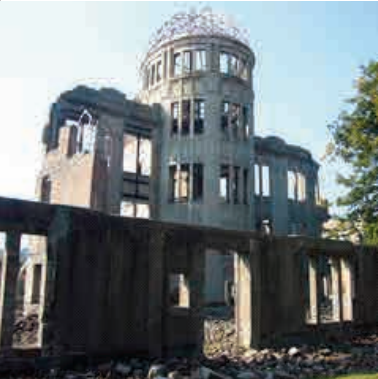
Hiroshima Peace Memorial (Genbaku Dome), Japan, 1996