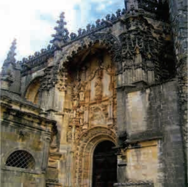
Convent of Christ in Tomar, Portugal, 1983