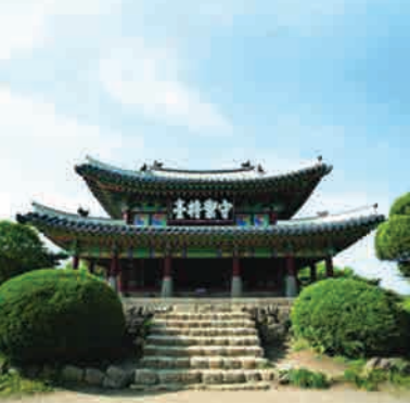
Namhansanseong, Republic of Korea, 2014