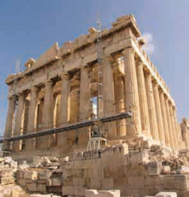
Acropolis, Athens, Greece, 1987