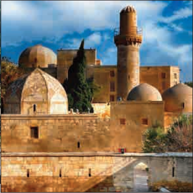
Walled City of Baku with the Shirvanshah's , Azerbaijan, 2000