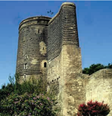
Maiden Tower, Azerbaijan, 2000