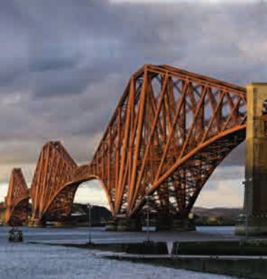
The Forth Bridge, England, 2015