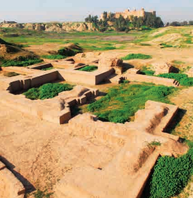
Susa, Iran, 2015