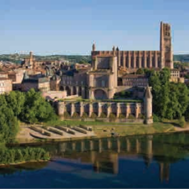
Episcopal City of Albi, France, 2010