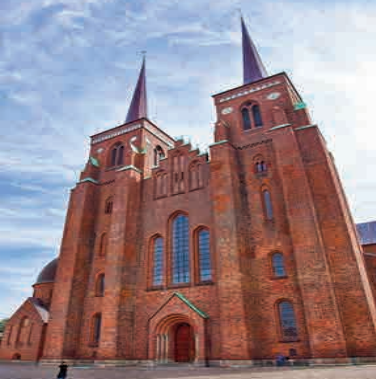
Roskilde Cathedral, Denmark, 1995