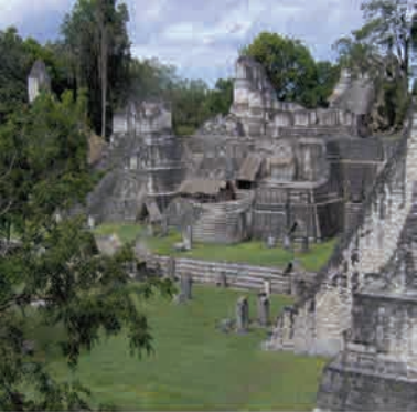
Tikal National Park, Guatemala, 1979