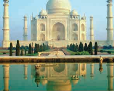
Taj Mahal, Agra, India, 1983