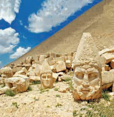
Nemrut Dağ, Turkey, 1987