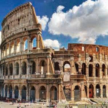
Historic Centre of Rome, Coliseum, Italy, 1980