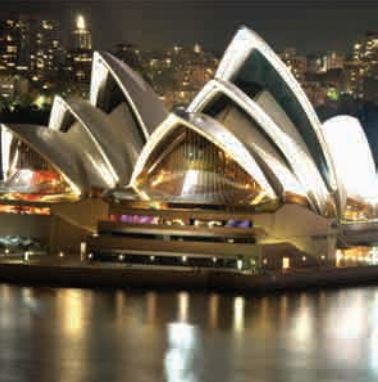
Sydney Opera House, Australia, 2007