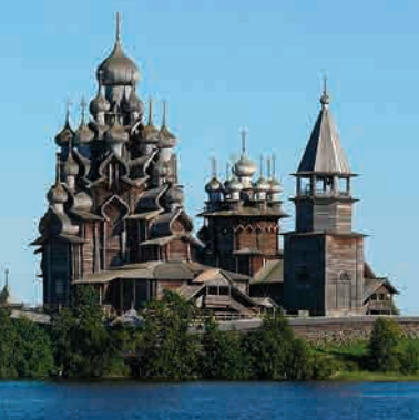
Kizhi Pogost, Russian Federation, 1990