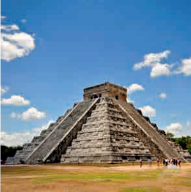
Pre-Hispanic City of Chichen-Itza, Mexico, 1988