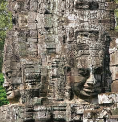
Angkor, Cambodia, 1992