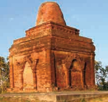
Pyu Ancient Cities, Myanmar, 2014