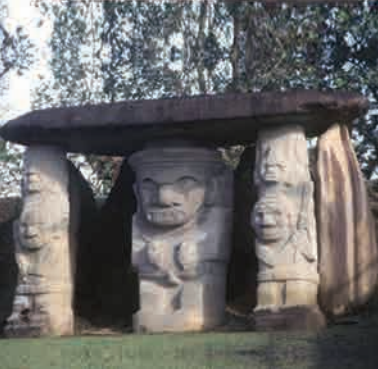
San Agustín Archaeological Park, Colombia, 1995