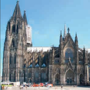
Cologne Cathedral, Germany, 1996