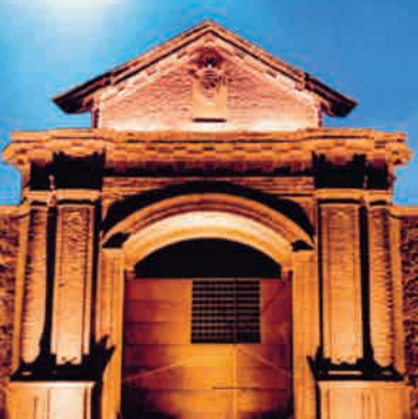
Heritage of Mercury. Almadén and Idrija, Slovenia, Spain, 2012