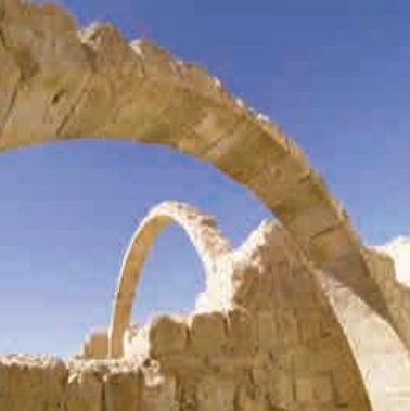
Incense Route - Desert Cities in the Negev, Israel, 2005