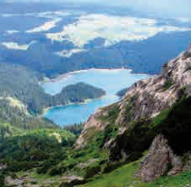
Durmitor National Park, Montenegro, 2005