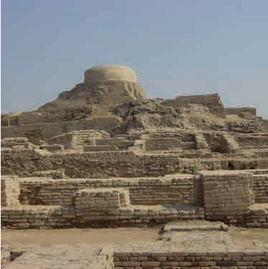
Archaeological Ruins at Moenjodaro, Pakistan, 1980