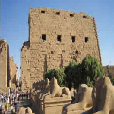
Ancient Thebes with its Necropolis, Egypt, 1979