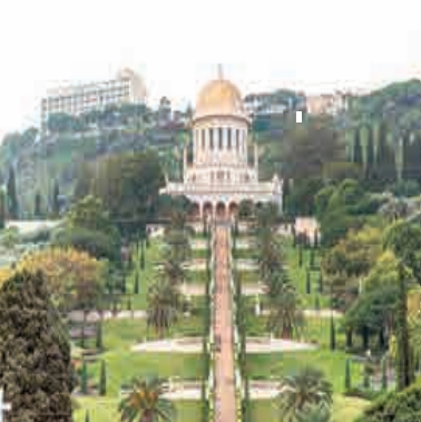
Bahá'i Holy Places in Haifa and the Western Galilee, Israel, 2008