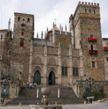
Royal Monastery of Santa María de Guadalupe, Spain, 1993