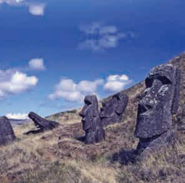
Rapa Nui National Park, Chile, 1995