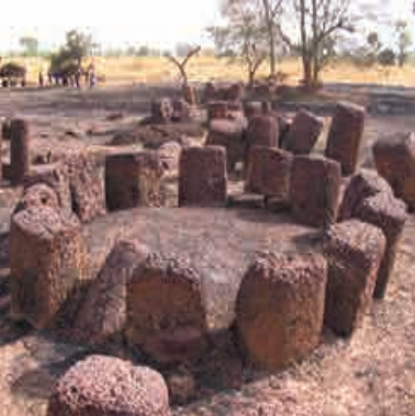
Stone Circles of Senegambia, Gambia, Senegal, 2006