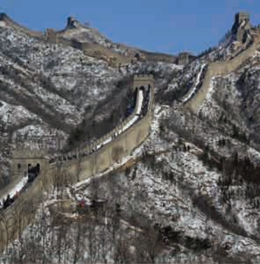
The Great Wall, China, 1987