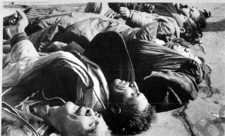
Azerbaijanis exposed to chemical weapon in Khojaly