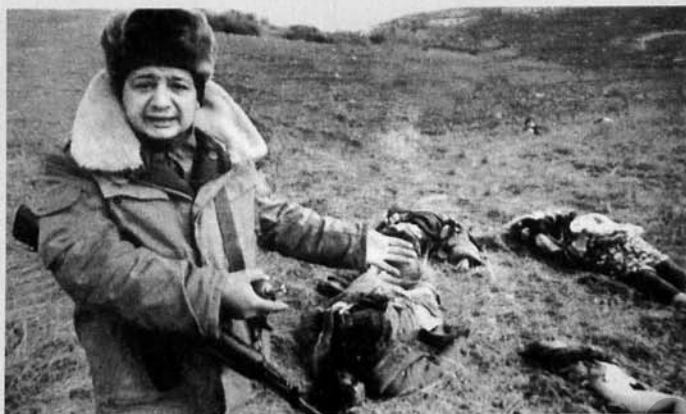
KHOJALY: a family subjected to the Armenian terror