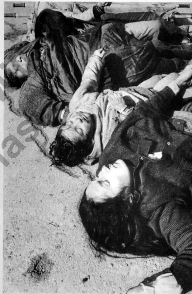
Victims of the Armenian terrorism in Khojaly

Today, on 26 February 2012, on 20th anniversary of this tragedy we with deep sorrow pray for Khojaly shahids (613 killed including corpses of those whom Armenians maimed so that it's impossible to identify them and more than 1000 persons who are missed and also considered as killed). We pray Allah for them and once again want to try to persuade all their nearest and dearest and also all Azerbaijani people that truth will triumph over and ideas that Khojaly shahids fought for will live for ever in free and independent Azerbaijan Republic.