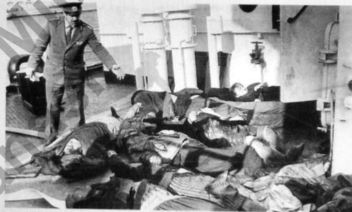
A crime committed by the Armenian terrorist organization "ASALA"