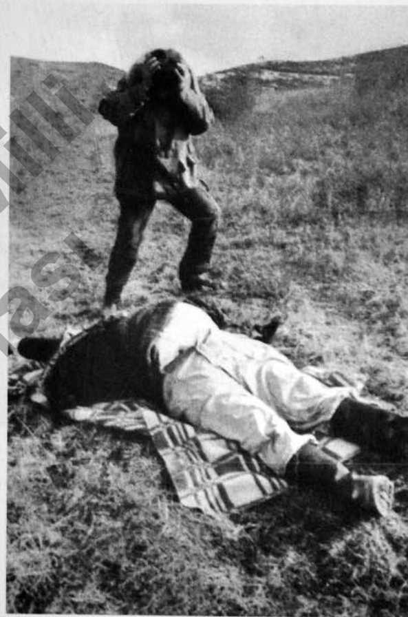
An Azerbaijani beheaded by the Armenian terrorists